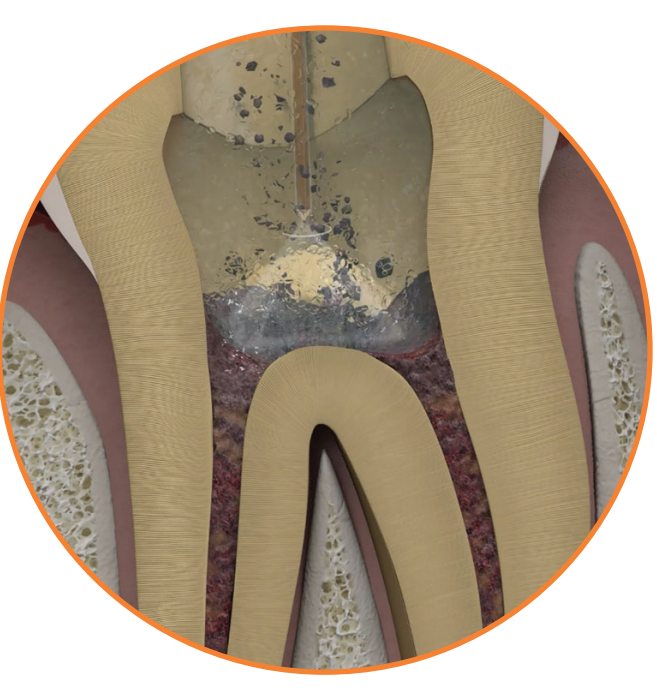
The dental pulp and debris is removed and disinfected.