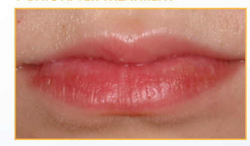
Inflammation is gone and treated area is completely healed.

1. Basirat M. The Effects of the Low Power Lasers in the Healing of the Oral Ulcers: J Lasers Med Sci 2012; 3(2): 79-83