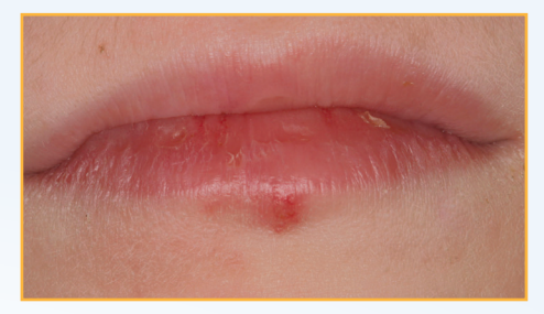
Large, inflamed cold sore before treatment.