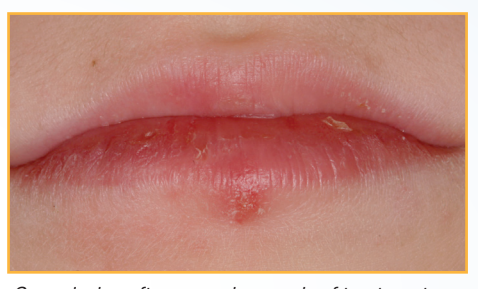
Same lesion after several seconds of treatment with the Epic laser. Patient reported immediate pain relief.