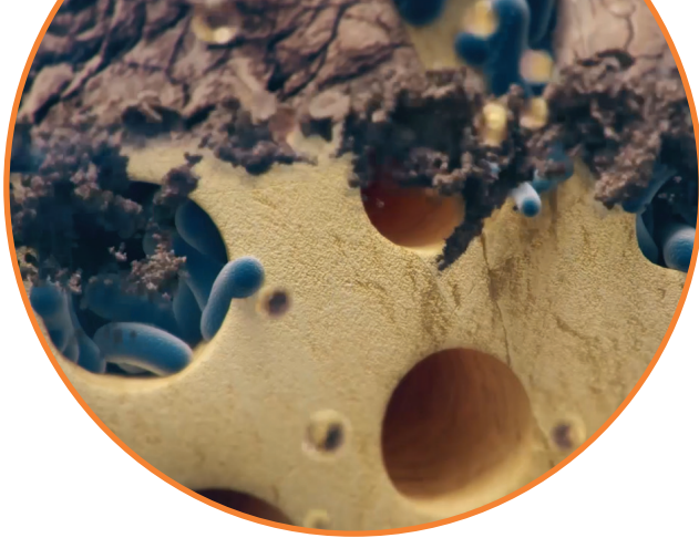
Debridement and disinfection of the root canal walls, penetrating deep into the dentin tubules.