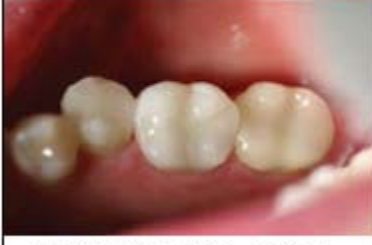
Figures 12 and 13 - Failing amalgam replaced with 3/4 all-ceramic CAD/CAM crown.