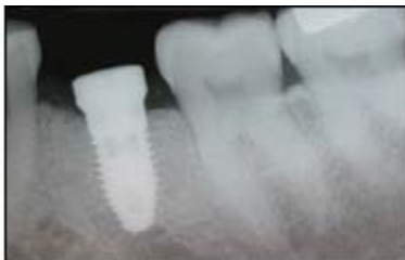
Figure 2 - Radiograph of implant after complete integration.