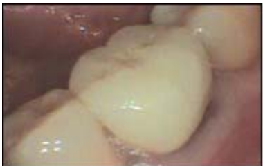
Figure 1 - Preoperative intraoral photograph of tooth No. 19.

In his findings via the electrical discharge test, CAD/CAM was the one technique that met the passive-fit criteria of less than 10.0 \mu\text{m} . 8 The benefits of the CAD/CAM technique are founded on homogeneous milled restorations without defects associated with castings, polymerization (shrinkage), and/or porcelain firings. Drago confirms, "ultimately, the success of implant-retained restorations depends on several complex factors: bone response to the implants, soft tissue response to the implant-abutment/crown interfaces, and stability and accuracy of the implant abutment connection." 8