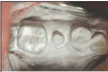
Figure 5 - Implant abutment is powdered and ready to be scanned.