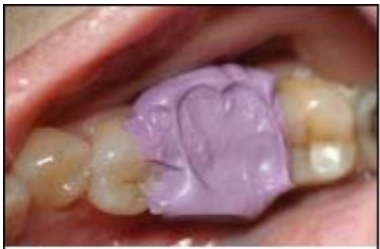
Figure 4 - Bite registration for tooth No. 19 and opposing (occlusal) dentition.