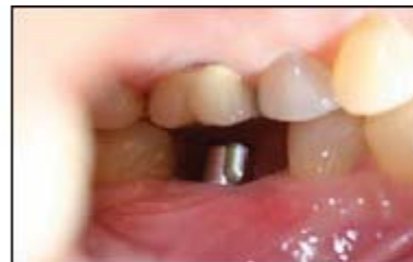
Figure 3 - Abutment placed on implant and tightened to manufacturer's specifications.