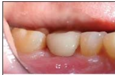
Figure 9 - CEREC all-ceramic crown after cementation on implant abutment.

Dental database mode – In this clinical example using the database mode, a 62-year-old woman received a single-visit CAD/CAM onlay that treated recurrent decay under a previously placed gold onlay (Figures 10 and 11).