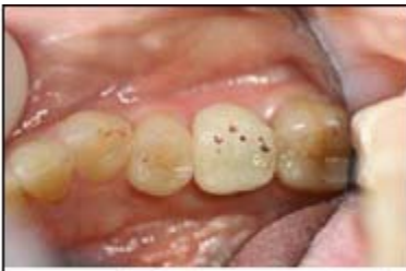
Figure 8 - Occlusion is verified with articulating paper.