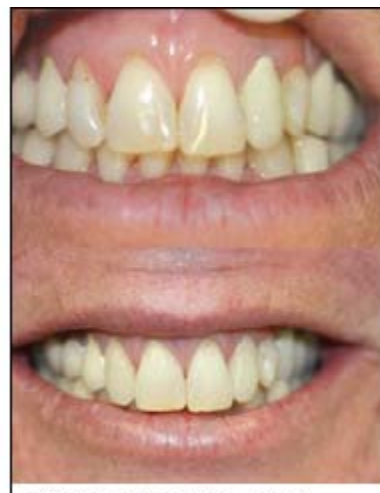
Figures 14 and 15 - PFM crown replaced with all-ceramic CAD/CAM crown.

Replication and correlation mode – A 48-year-old woman presented with a tooth No. 7 that had existing composite restorations with recurrent decay on the mesial, lingual, distal, and facial aspects. The patient was also unhappy with the PFM crown contours and color on tooth No. 10. She desired the shape of both of the lateral incisors to match tooth No. 7. Tooth No. 10 was restored first in replication mode, allowing us to duplicate and mirror the exact contours of tooth No. 7. Tooth No. 7 was then restored in correlation mode to recapture the existing contours. Note the symmetry of contours on tooth No. 7 and tooth No. 10 (Figures 14 and 15).