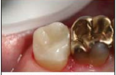
Figures 10 and 11 - Gold onlay replaced with all-ceramic CAD/CAM onlay.